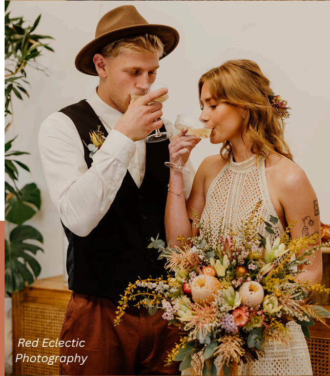
Red Eclectic Photography